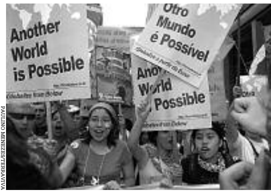
New planes of vision: youth permeated the forum.

on a global basis, to make room-in greater depth each year-for the search for alternatives to the dominant (and sputtering) world model.