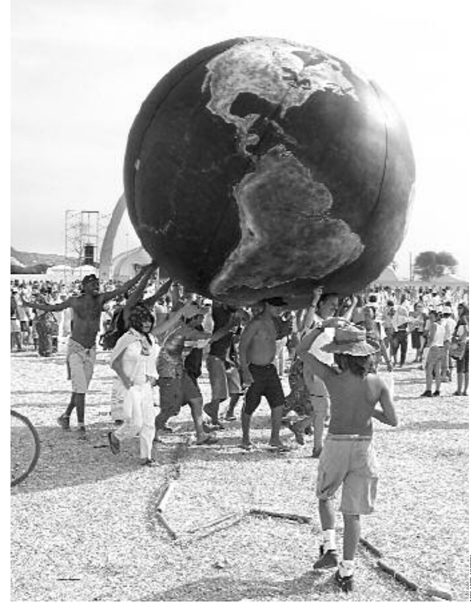
They've got the whole world in their hands: the fifth World Social Forum in Brazil.

think we're too often content to be the decoration, but that's another conversation.) To my mind, this is the mother lode of missed opportunities. It's what artists—especially theatre artists—do, for god's sake: imagine